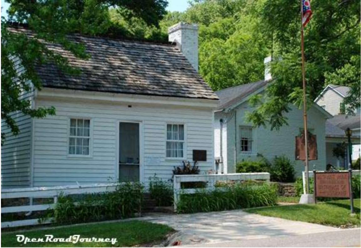
Grant's birthplace... $2 to tour a bit of history. Not bad.